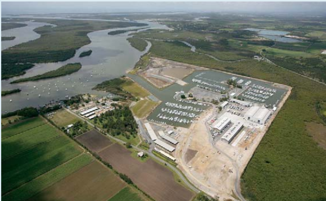
An aerial view of Meridien Marinas at Horizon Shores.