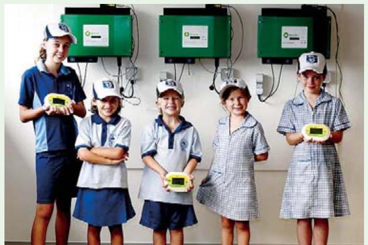
Children enjoy the Hutchinsolar Experience to learn about solar energy and energy efficient buildings and graduate with a Hutchinsolar Certificate.

Other features include motion sensors and timers to switch lights on and off, individual offices air-conditioned without cooling the remainder of the building, skylights to reduce the need for artificial light during daylight hours, metal shelves to prevent direct access of