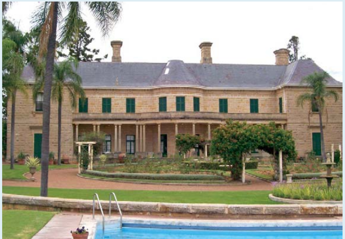
Jimbour House via Dalby ... renovations include a new kitchen block.

Job Description: Works include construction of new kitchen block and visitors' toilet block, both separate to the main house, and demolition of the existing kitchen joined to the rear of the main house. Renovation of the rear verandahs