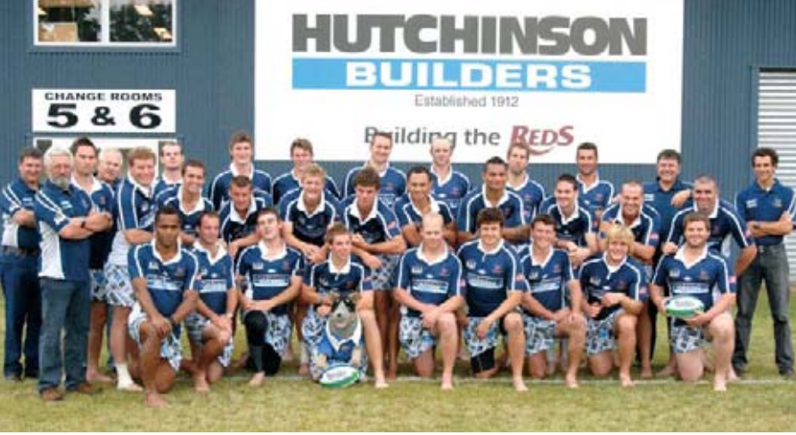
The Hutchinson Builders Queensland Country Healers squad proudly wear their Hutchies' Undies in the lead up to the Australian Rugby Shield.