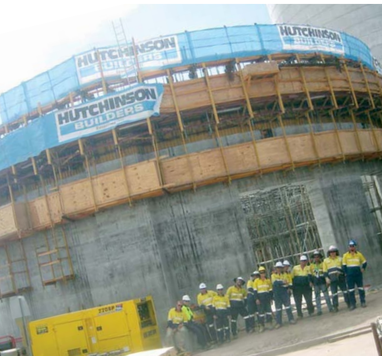
Something is not on the level here.