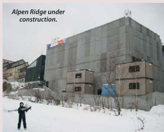
Alpen Ridge under construction.

The region's popularity with young Australian professionals has put pressure on 'westernised accommodation' often booked eight months in advance.