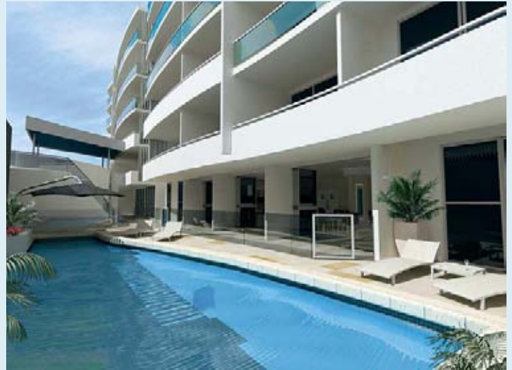
Dolphin Suites ... 42 two and three-bedroom luxury apartments over eight levels valued at $15.4million.

existing budget accommodation facility. Works involve new internal fit-out of accommodation areas to ensure compliance of current statutory and regulatory requirements.