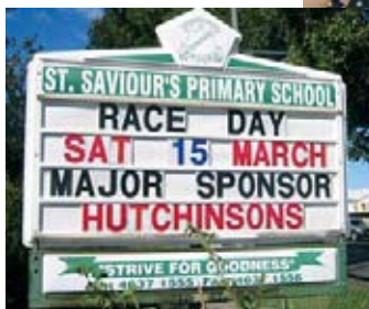
Thankyou sign for Hutchies at St Saviour's Primary School.