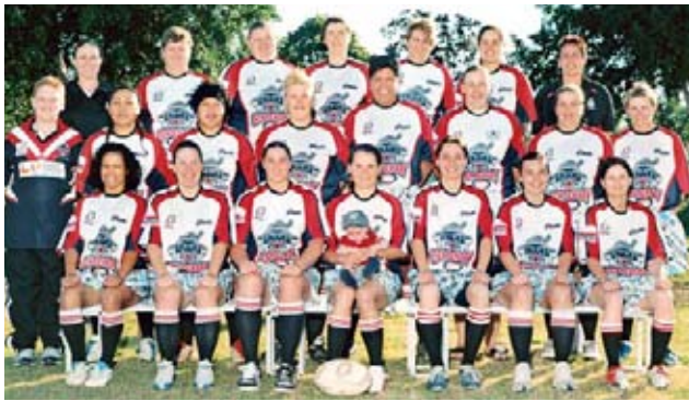
Footballers kick butt West Centenary Women's Rugby League team won the 2007 Grand Final in convincing style against West Mitchelton with a 20-16 full-time score.