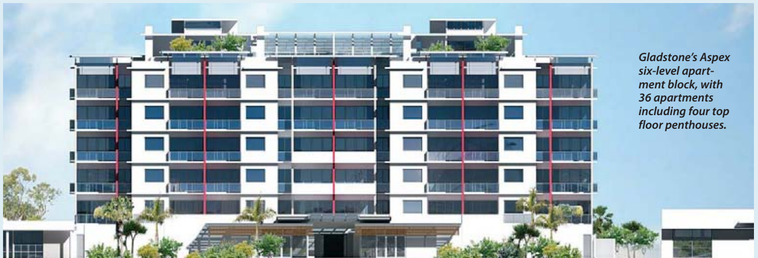
Gladstone's Aspex six-level apartment block, with 36 apartments including four top floor penthouses.

Job Description: The project consists of a 240sqm extension to the existing